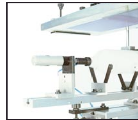
Air inflation unit