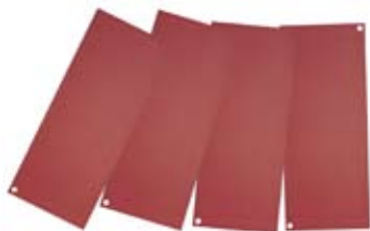
polymer plates (alcohol developing)

constant results with developing of polymer plates