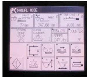
PLC control touch screen panel