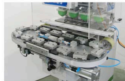
Different sizes servo drive conveyors